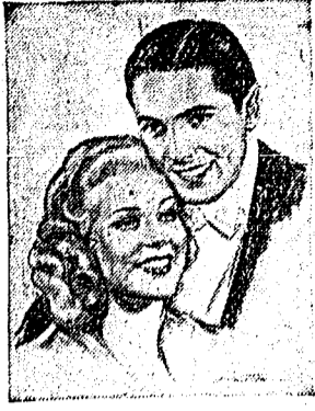
Alexander's Ragtime Band Starring Alice Faye and Tyrone Power Starting Sunday at the Loew Poll Bijou Theatre. This is a $250,000.00 Movie Quiz Picture.

— ALSO — Richard Dix, Chester Morris in "SKY GIANT" Play Honey Sat. Nite