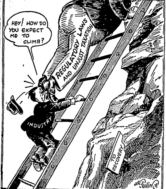
HEY! HOW DO YOU EXPECT ME TO CLIMB?