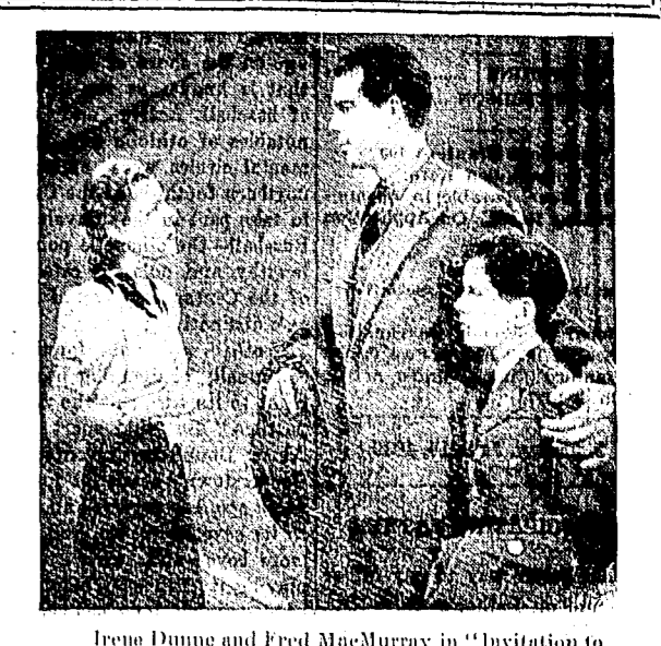
Irene Dunne and Fred MacMurray in "Invitation to Happiness" now showing at the Paramount Theatre in New Haven.