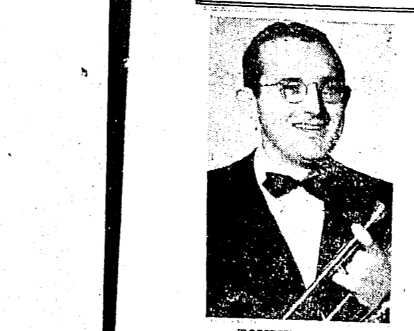
Tommy Dorsey, the famous "Sentimental Gentleman of Swing" with his mellow trombone and his orchestra, will start an in-person engagement on the stage of the State Theatre, Hartford, this week Friday, Saturday and Sunday, for 3 days only.

Young and older persons alike enjoy the pure, delicious sweets featured at De Luxe Sweets Fea-