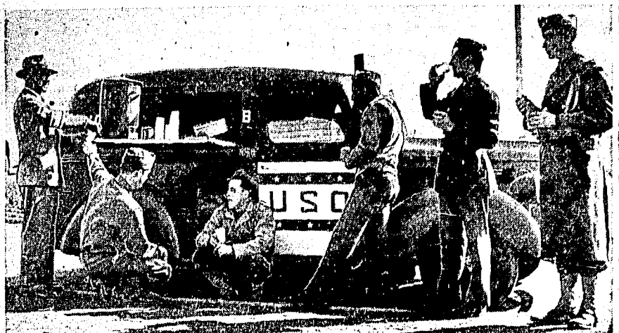
When the soldier can't go to USO, USO goes to the soldier. Here are Army men, on detached duty at a post far from camp and USO clubhouses, getting coffee and doughnuts from the operator of a USO mobile unit. These traveling clubs also bring movies, cigarettes, games, writing materials and reading matter to isolated units of the fighting forces. It is to carry on the USO clubhouse program and such other services as mobile units that the USO War Fund Campaign for $32,000,000 will be conducted May 11-July 4.