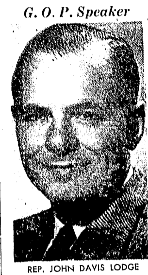
REP. JOHN DAVIS LODGE