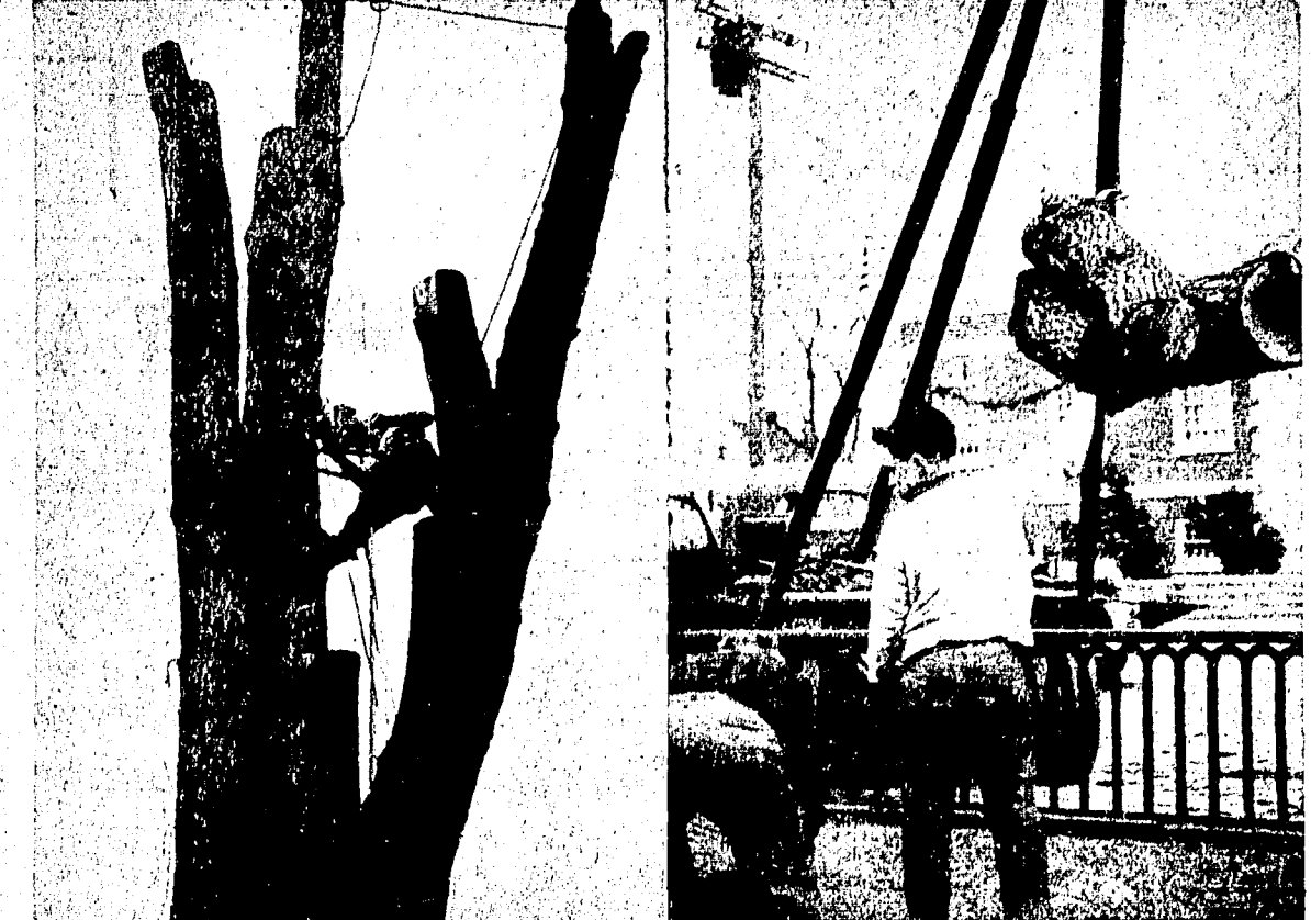
Left-Alex Satrioli, of the Pond Lily Company, tree experts, rigs a tackle for removing the larger limbs from the dead elm tree ...

The large limbs were cut off with a power saw and sawdust blown to the ground. Right—Quickly sawed up into logs of manageable length, the tree is loaded aboard a truck for removal.