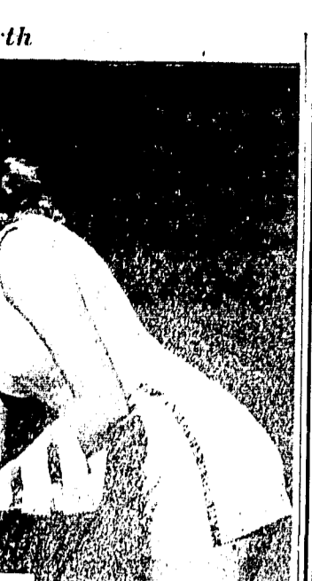
Rita Hayworth sparkles as she poses in an evening dress for a safe and sane Fourth of July.

KNUDSEN BROS. STORE 305 MAIN ST. • EAST HAVEN Open 7 Days A Week 10 AM-11 PM AIR CONDITIONED OPEN JULY 4TH