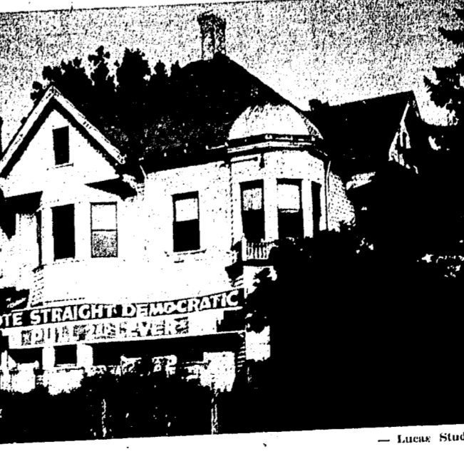
The old Comstock home, at 245 Main St., is sporting the banners of the Democratic Party as the local campaign for the coming town elections gets under way. The local party will hold open house Tuesday evening following a meeting of the town committee at 8:15. The public is invited. The present owners of the property are planning to sell or lease the site for a branch bank.