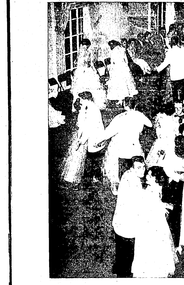
Shown are some of the 30 couples who attended the High School Junior Prom Friday night at the Lawn Club in New Haven.