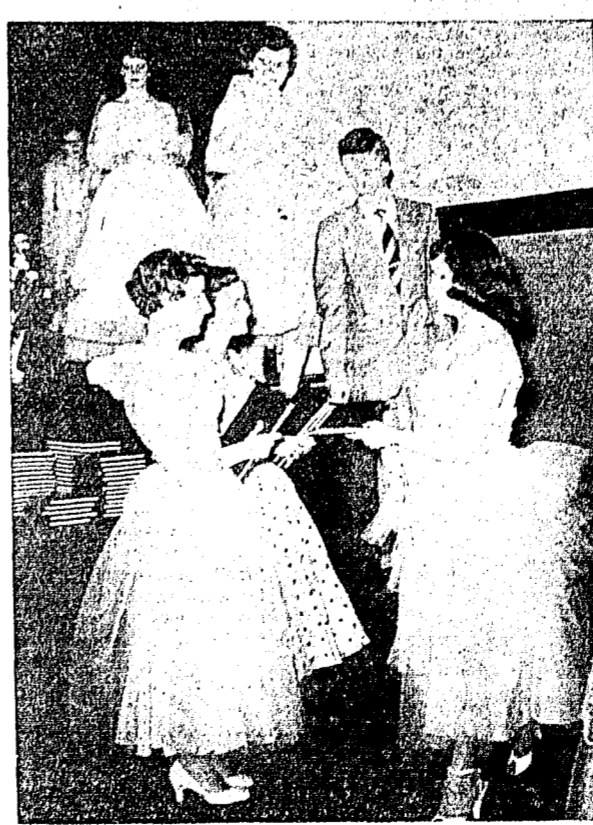
— News Photo