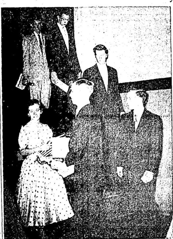
Students of the graduating class at the High School are handed their copies of the senior class yearbook, the Pioneer, at the close of the Class Day program Tuesday evening in the school auditorium.