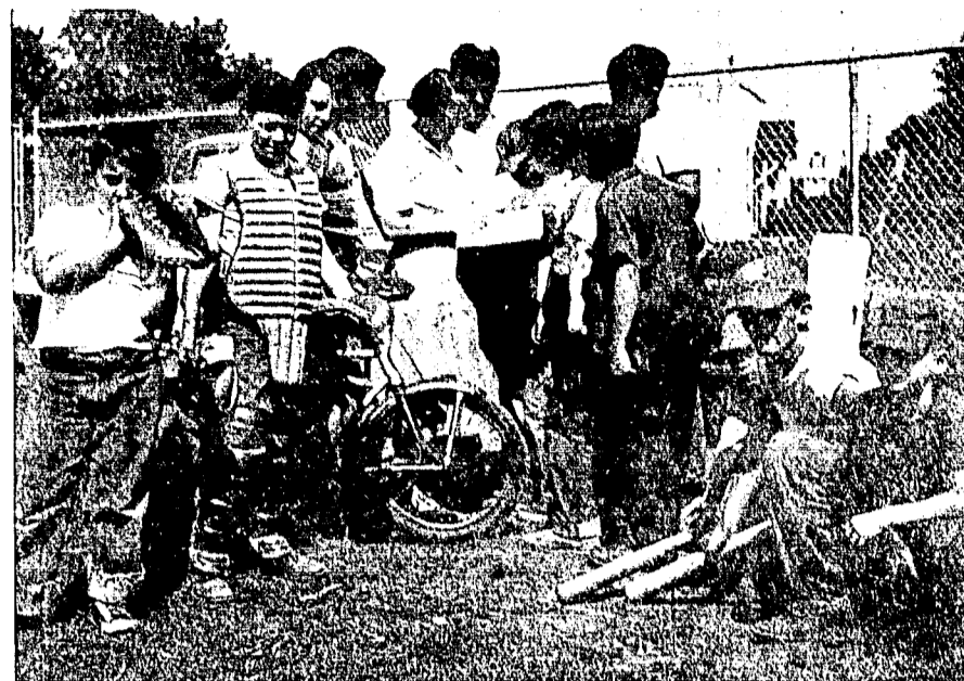
Summer Recreation Program Opens