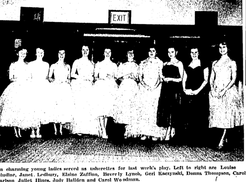
Fun charming young ladies served as understudies for last week's play