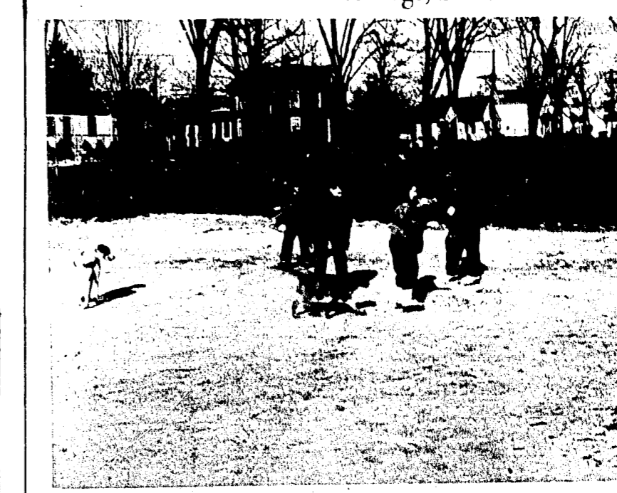
In addition to skaters the rink at Memorial Field also proves an attraction to sleds and dogs. With the ground frozen in the recent cold snap a lot of the loan bank around the outside, wading the rink freezes in place to provide a safe skating area for youngsters. (News Photo).