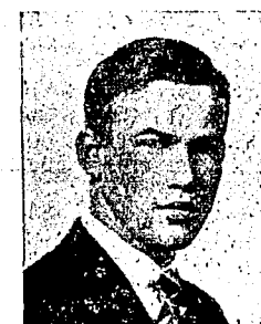
The above students took a prominent part in the Graduation and Class Day Exercises of the East Haven High School during the past week.