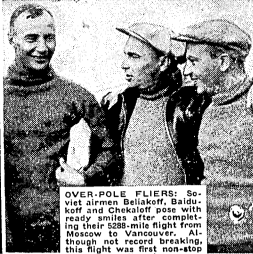
OVER-POLE FLIERS: Soviet airmen Beliakoff, Baldukoff and Chekaloff pose with ready smiles after completing their 5288-mile flight from Moscow to Vancouver. Although not record breaking, this flight was first non-stop over the north pole.