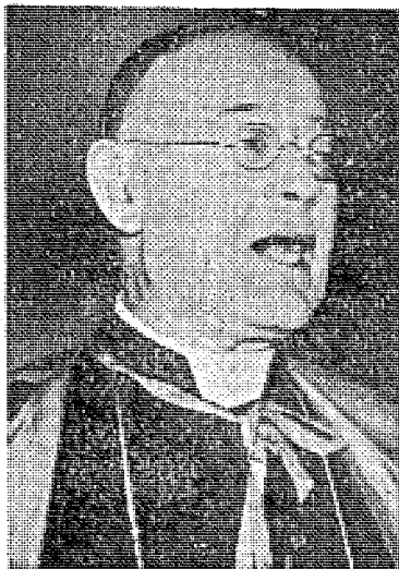
Most Rev. Arthur Hinsley, archbishop of Westminster cathedral in London, has been selected as one of five new cardinals by Pope Pius. He is the first Englishman to be accorded this recognition by the Catholic church in many years.