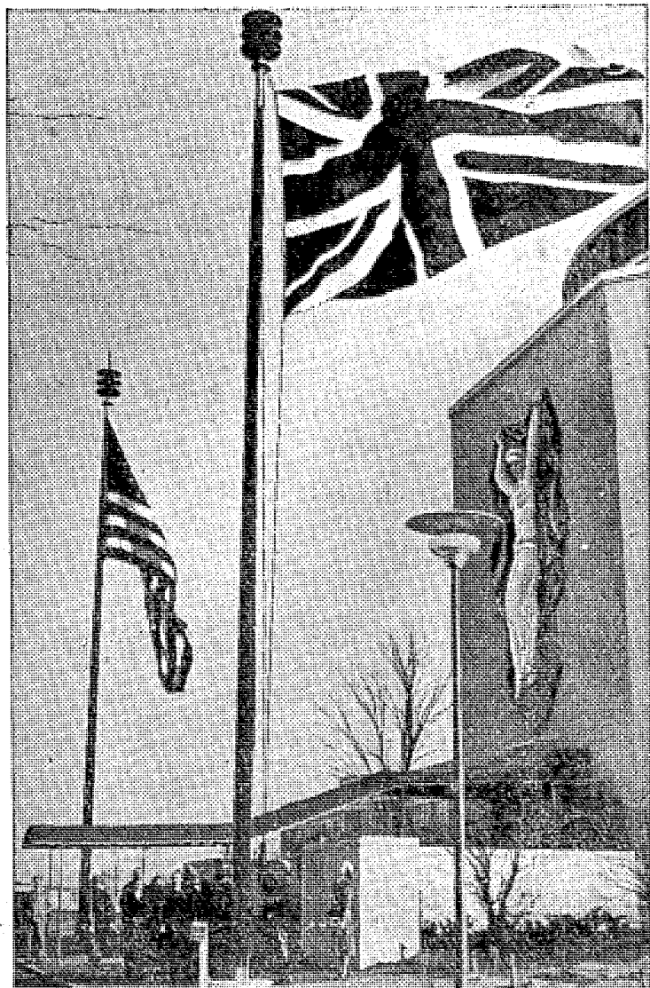
NEW YORK—A stirring scene in front of the Administration Building at the New York World's Fair 1939 as the Union Jack of Great Britain is hoisted aloft signifying that John Bull will be represented at America's exposition. The British exhibit will occupy 140,000 square feet, the largest of the 64 foreign displays now being prepared, and will cost several millions.