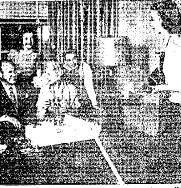
Daughter uses the camera while mother and dad open an anniversary gift,